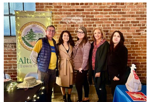
'SIP AND SHOP' with volunteers, friends and CA State Senator Sasha Renee Perez (see President's Message).