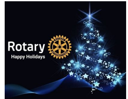
D. Vance Graphics