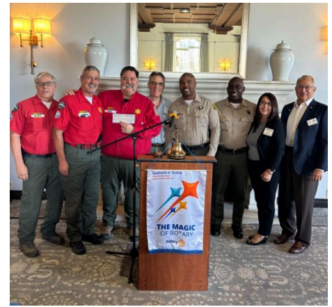
Check presentation to Altadena Mountain Rescue Team (above) and Altadena Heritage (below)