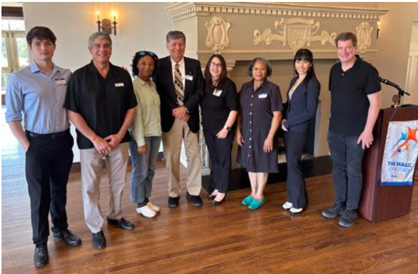
Guests at last week's meeting.

Wishing a very Merry Christmas and Happy Holidays to all! See you in 2025!