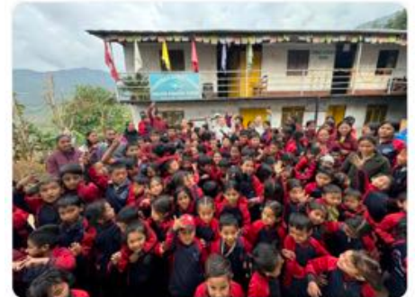
Laligurash School and Community Hospital (incl. the ambulance provided by our Global Grant). Health and happiness to all!