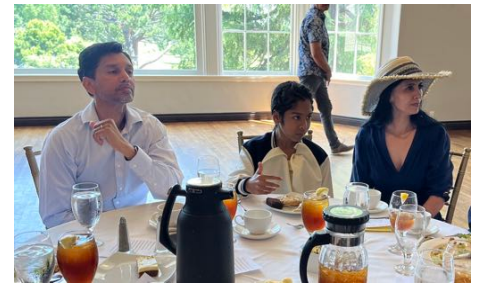
Guests from South Africa