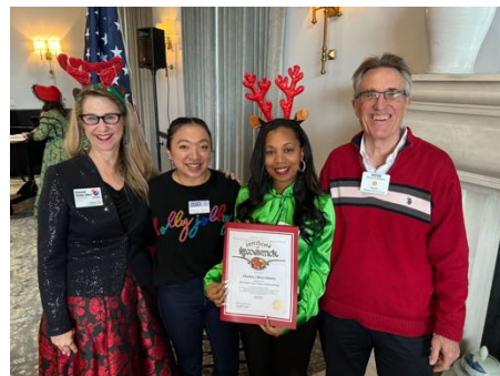
Altadena Library District