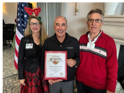
Altadena Town and Country Club