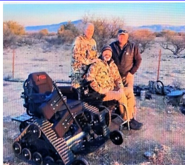
Action Track Chair and crew