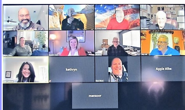
Early screen shot, we had 22 members by the end!