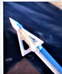
Believe it or not, that is a bow and arrow! It shoots at 284 ft/sec, and he has hit targets at 105 feet!