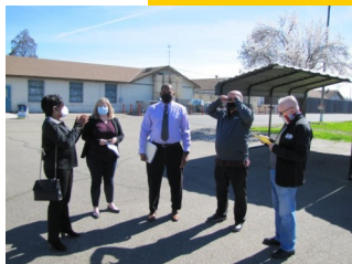
Rotarians gather for the tour.