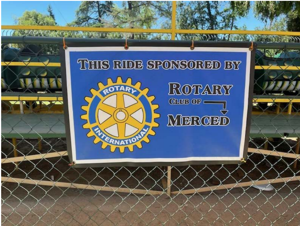
Merced City Cleanup - Rahilly Park - June 11