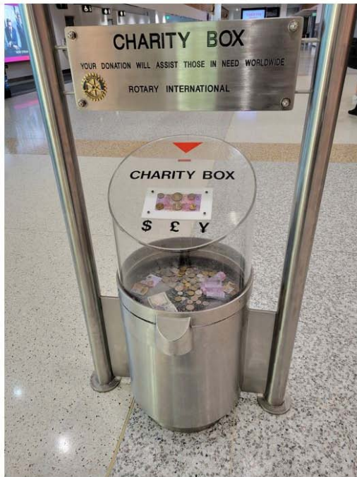
Rotary At the Sydney Airport