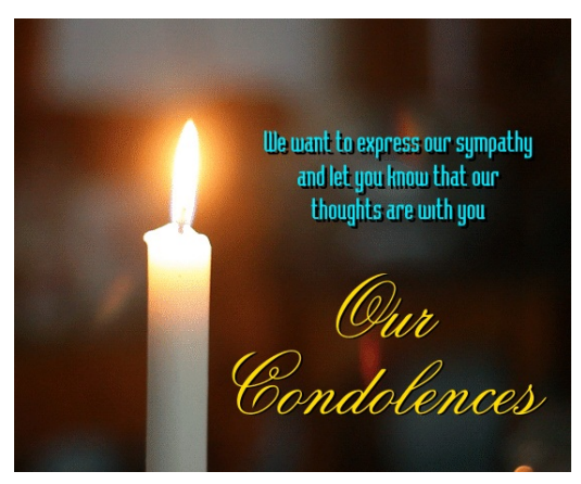
SUSAN WOOD We extend our deepest condolences and prayers to Susan, whose mother passed away last week.