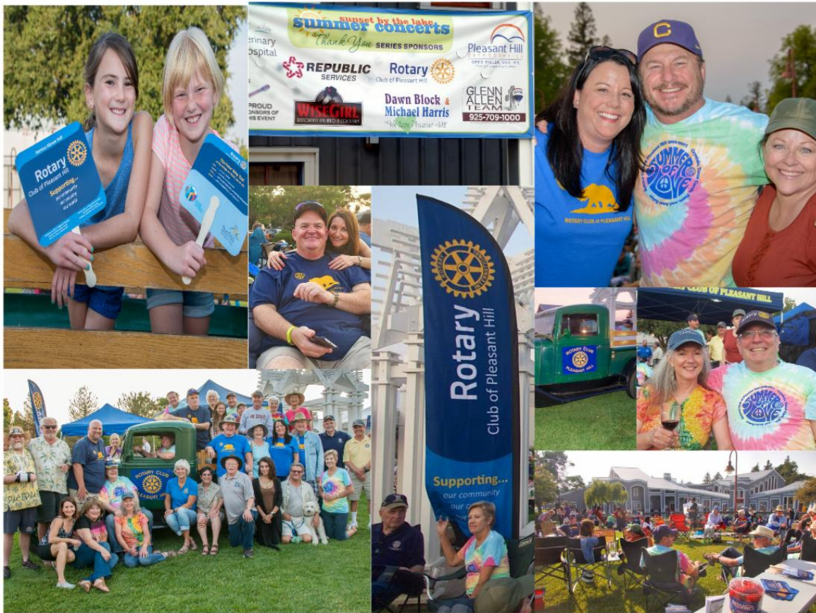
At Concert by the Lake 8-20-17