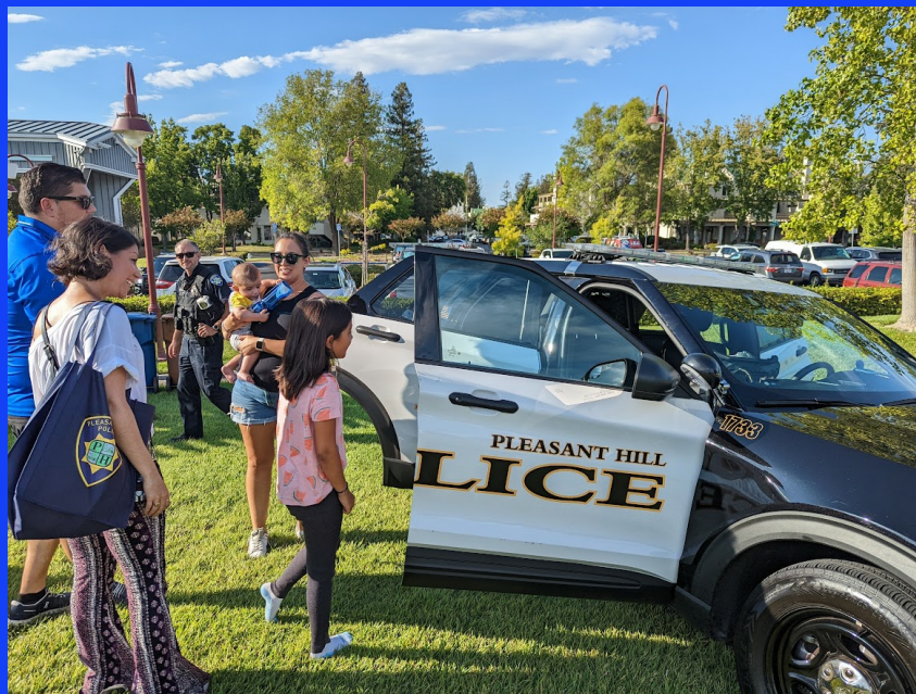
Local residents and their kids got the opportunity to meet and greet the officers of the Pleasant Hill Police Department