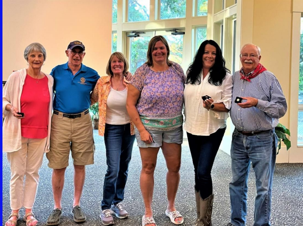
NEW PAUL HARRIS FELLOWS