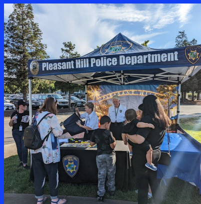
Pleasant Hill Police Department booth