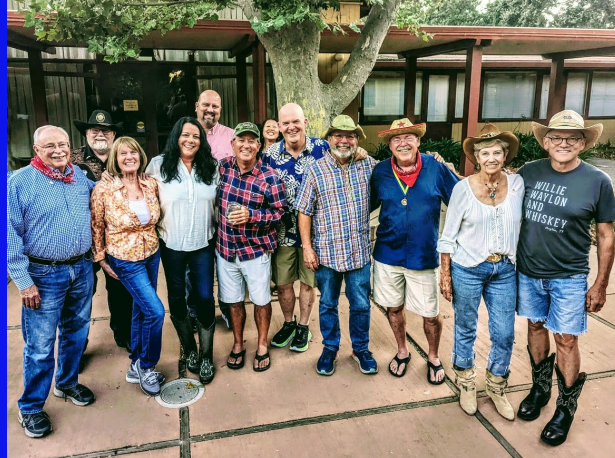
2021-22 BOARD OF DIRECTORS