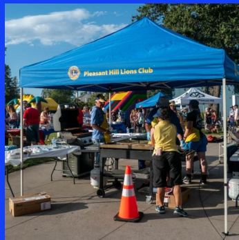
PH Lions Club Booth They cooked hot dogs and hamburgers