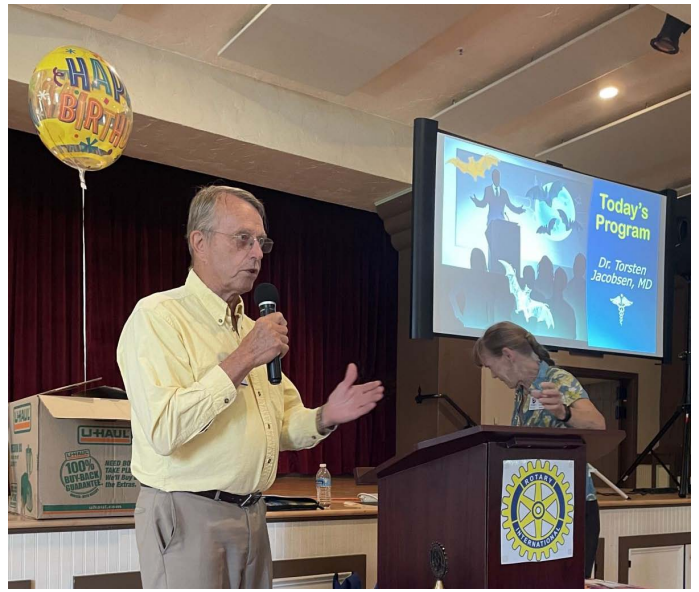
amazing and misunderstood creatures.

They have existed for 50 M years and are prolific pollinators, the largest volume seed distributors, and in my personal opinion (I hate mosquito bites) the biggest benefit is that they are insect eaters. The planet would be run over by mosquitoes if we didn't have bats. For example, the Braken Caves in Texas is home to 20 million bats, the largest bat community in the world. Every night, the bats come out and eat 20 tons of insects. They eat about 1,000 insects per hour. That's a whole bunch of mosquito bites stopped. But the pollination and seed distribution of these animals is no small feat either, as they can cover up to 60 sq km in one night. The bat is also the pollinator for agave plants, which can only be pollinated at night, and without the agave cactus we would not have tequila. I think we can all agree "that's a good thing". A lot of work from these