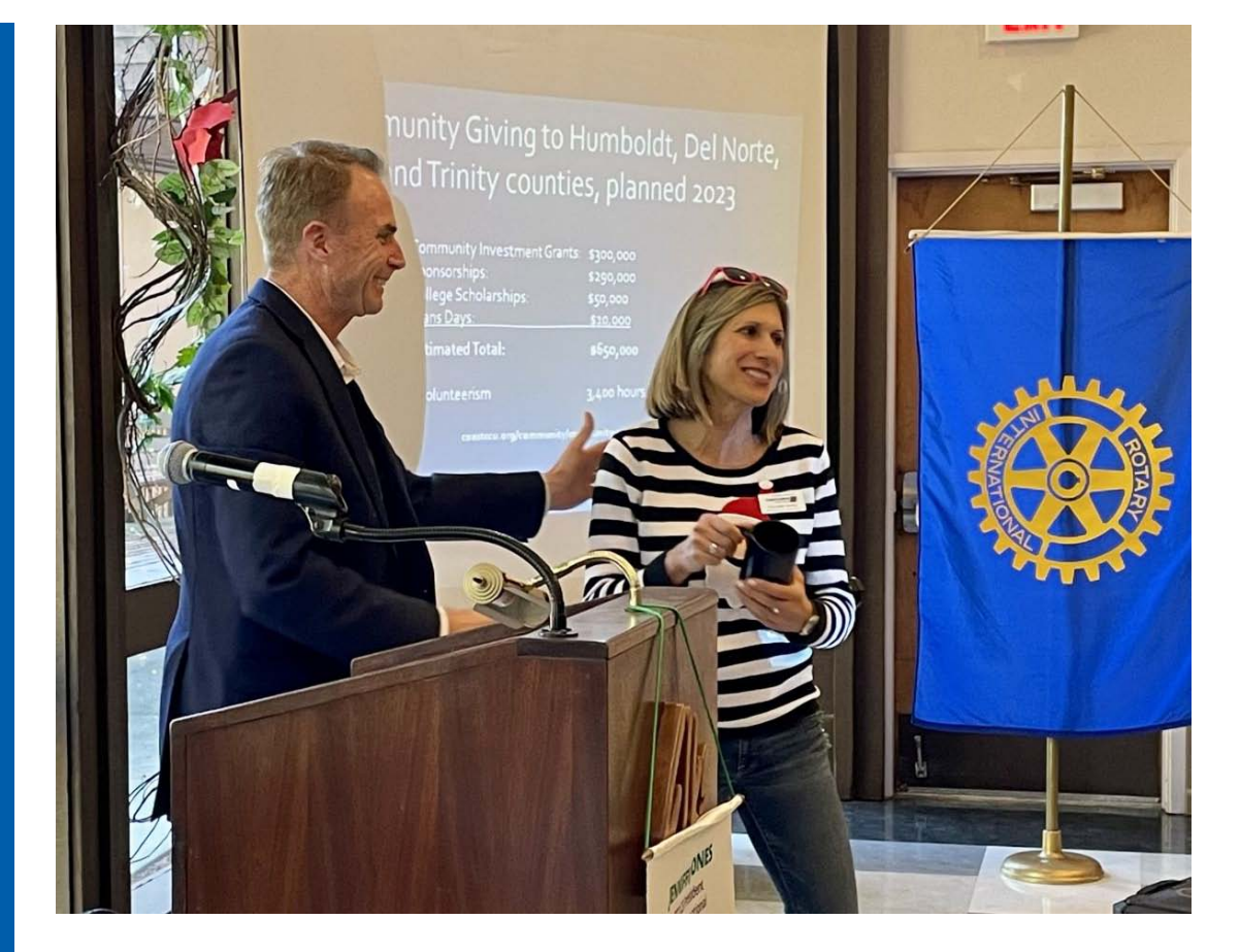
Meeting adjourned at 1:15