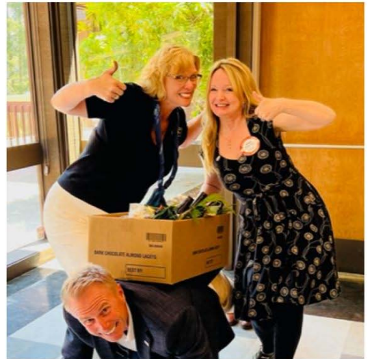
Individuals proposed for membership: