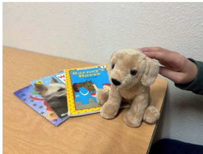
Stuffed Animal Puppy with Reading Books