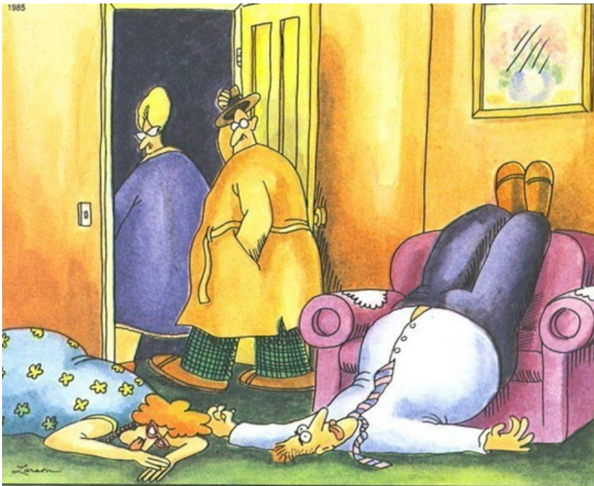
The Arnolds feign death until the Wagners, sensing awkwardness, are compelled to leave.