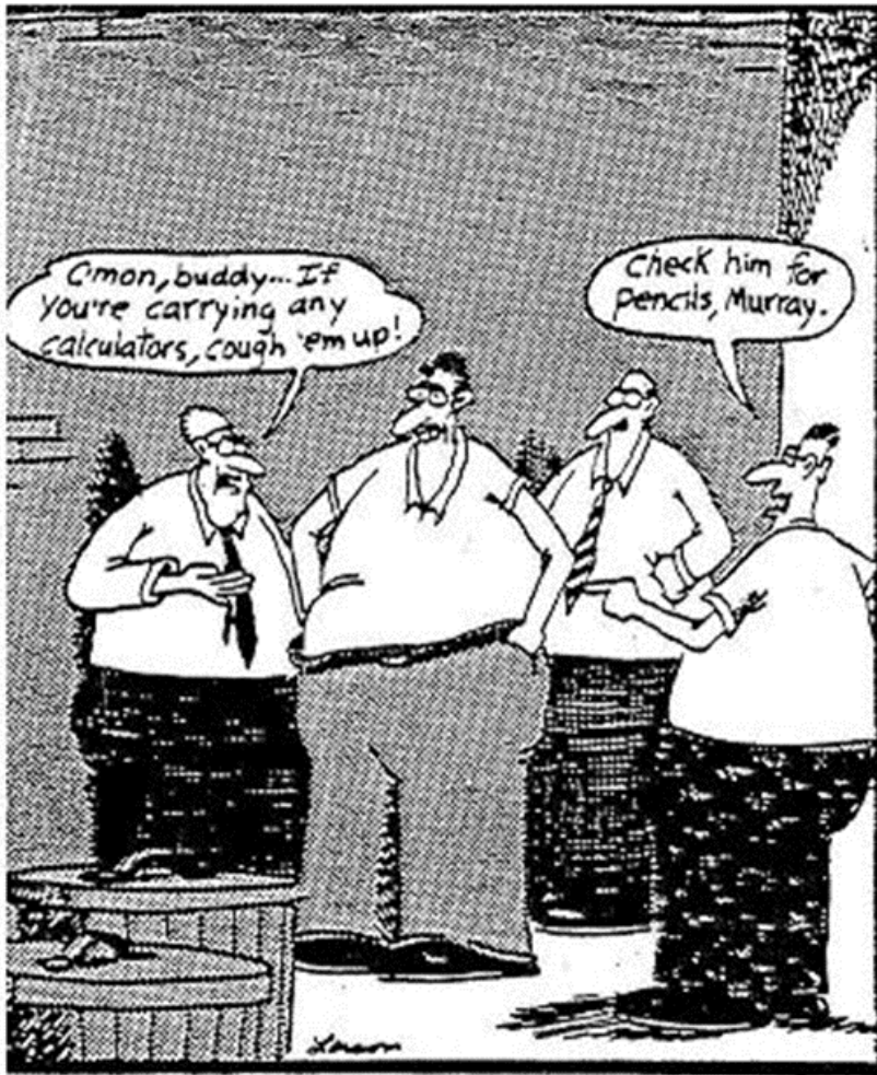
Accountant street gangs

"Look at that! ... Give me the good ol' days when a man carried a club, walked semi-erect, and had a brain the size of a walnut."