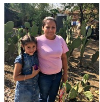
Photos: our Oaxaca project