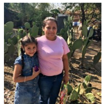
Photos: our Oaxaca project