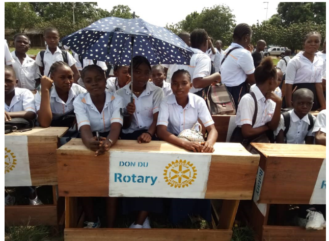
New school desks in Congo