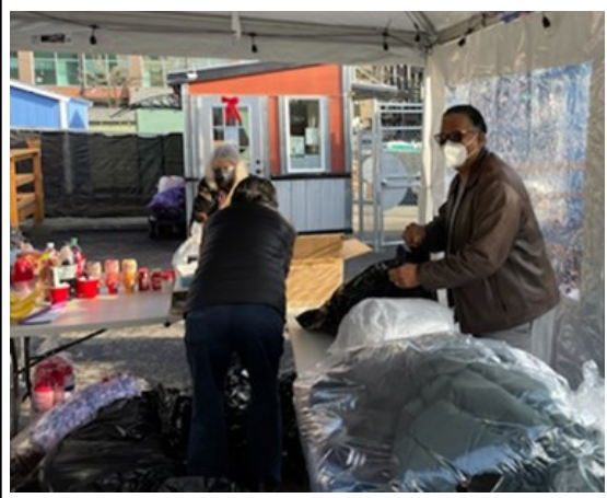
Left: $10,000 for warm winter coats for residents of Tiny House Villages and other nonprofits