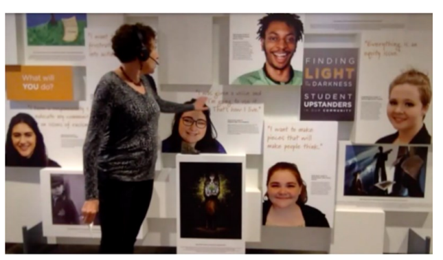
$5,000 to Holocaust Center for Humanity for Virtual Field Trips