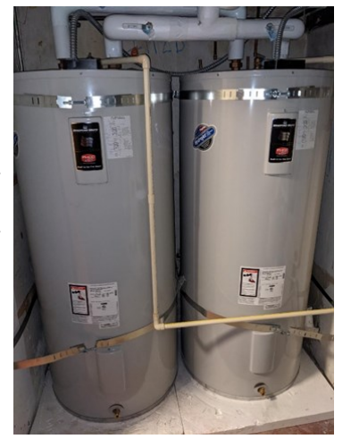
Right: $10,000 for water heaters at ROOTS shelter for homeless youth