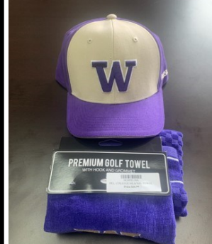
Show your purple pride with a UW Husky hat, premium golf towel and a bottle of wine.