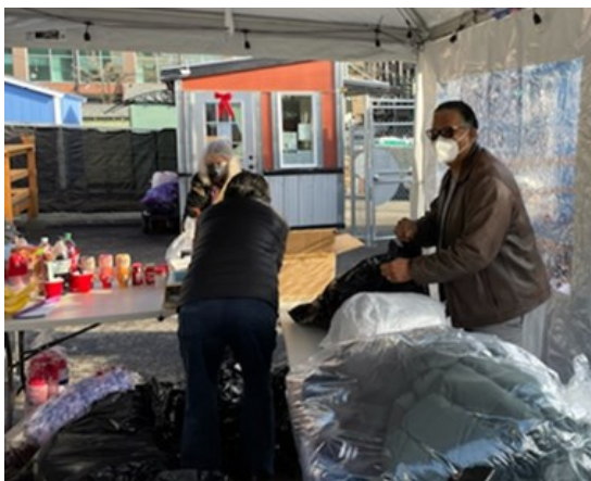
Left: $10,000 for warm winter coats for residents of Tiny House Villages and other non-profits