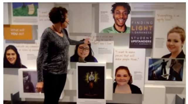
$5,000 to Holocaust Center for Humanity for Virtual Field Trips