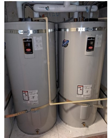
Right: $10,000 for water heaters at ROOTS shelter for homeless youth