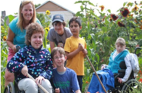
Left: $5,000 to Seattle Children's Playgarden for adaptive classroom equipment