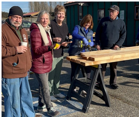
URDC Rotarians building P-Patch garden boxes

Rotarians who recently made dinners for Ronald McDonald House families