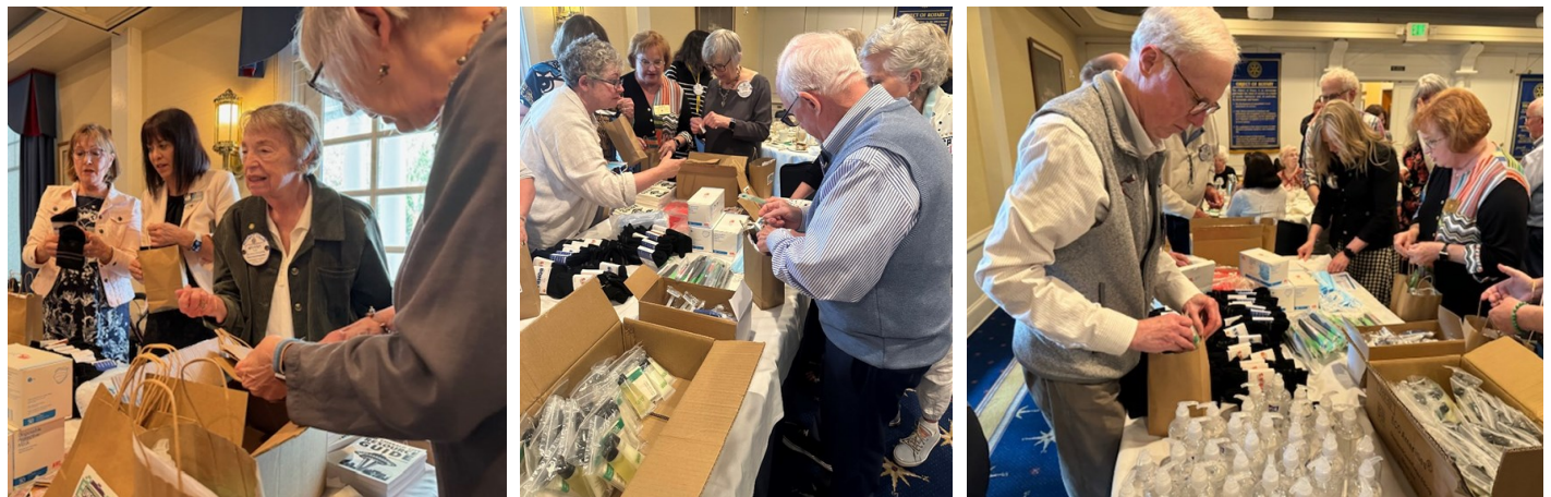
Rotarians put together hygiene kits for people living in their cars, who get services through University Heights Center.