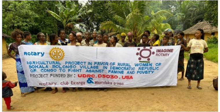
Celebrating 2022-23 Congo agricultural project