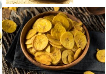
Baked plaintain chips