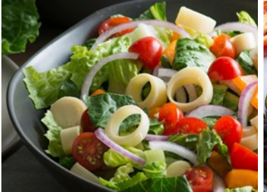
Palmitos salad Hilachas (shredded beef)

Here are some of the delicacies enjoyed that evening.