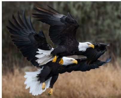
Skagit Valley Eagle Tour