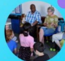
UNIVERSITY HEIGHTS CENTER