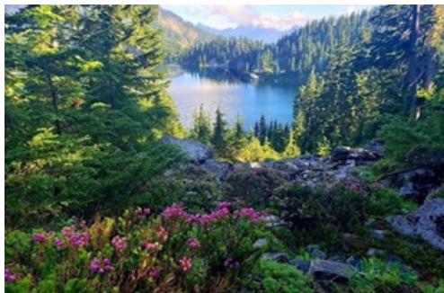
Snow Lake Hike

Have you had a chance to check out offerings on our auction site? Find it at: 2023 UDRC Fundraiser (auctria.com) . On-line bidding starts May 14. Some items to bid on: