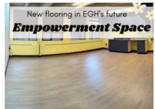
2022-2023 CSC project: Elizabeth Gregory Home renovation to better serve homeless women

Let's work together to get some outstanding applications from non-profits so we can continue to make a difference!