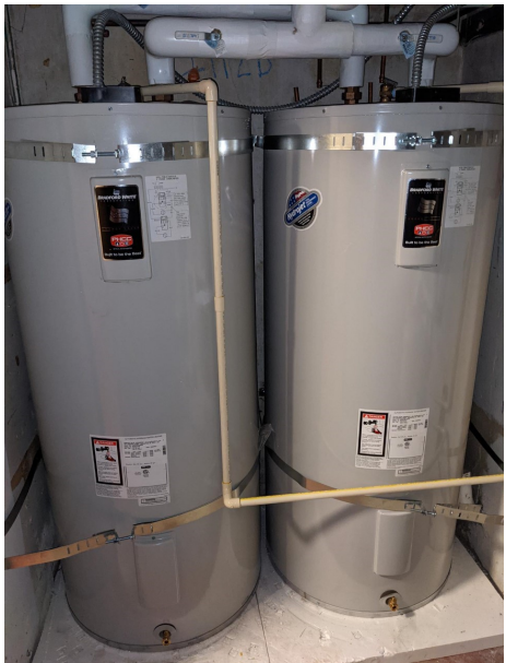
The new water heaters

From all of us at ROOTS, thank you very much UDRC!