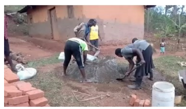
Democratic Republic of the Congo: village agricultural developmenttraining, supplies, seeds ($5,000)