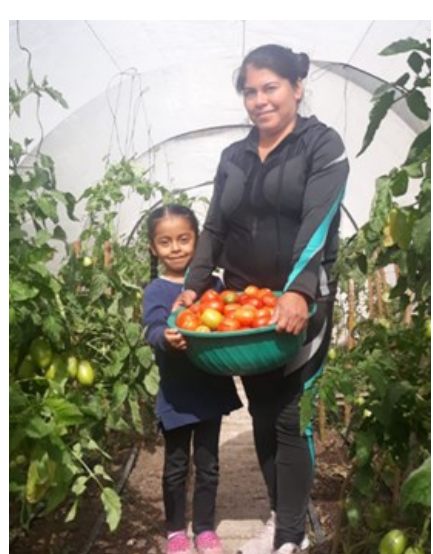
Mexico: harvesting tomatoes from family greenhouse