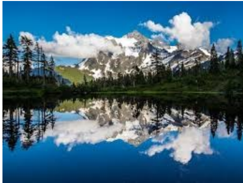
Weekend at Mt. Baker Townhouse Condo

Just click on Spring 2021 Fundraiser (auctria.com) and look for the Online Auction button on the upper right corner!