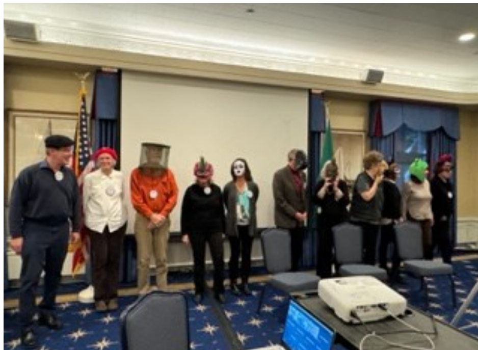
The contestants line up

Rotarians were invited to come to last Friday's meeting with Halloween hats and/or masks.