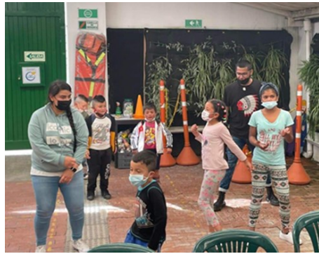
Colombia: Girls' Empowerment Project 2022