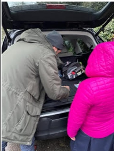
Putting water samples onto card

measurements at two sites on Maple Creek. The students measured the depth of the creek, the turbidity, the temperature and the speed of flow. Only the temperature instrument was purchased while all other items were homemade or available at home. The first photo shows the measurement of the depth of the water. The second shows the temperature gauge that only requires proximity to the object.