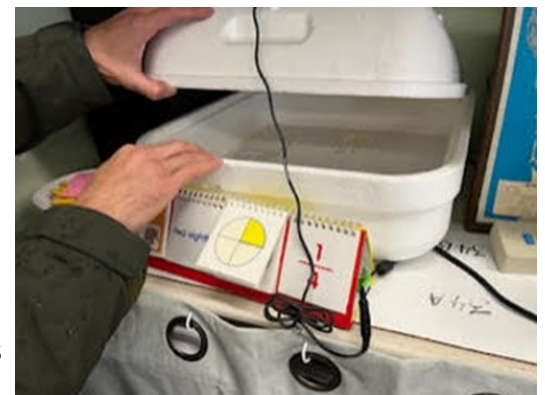
E coli cards are put into a warm box

The sampling takes place once a week throughout the school year and all students have opportunities to go to the creek sites to sample and measure. In addition, all students keep a record of the data collected, which is then used to