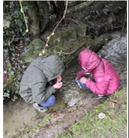
Using the temperature gauge

Students from the fourth grade at OLL went with a trained parent volunteer to take a variety of