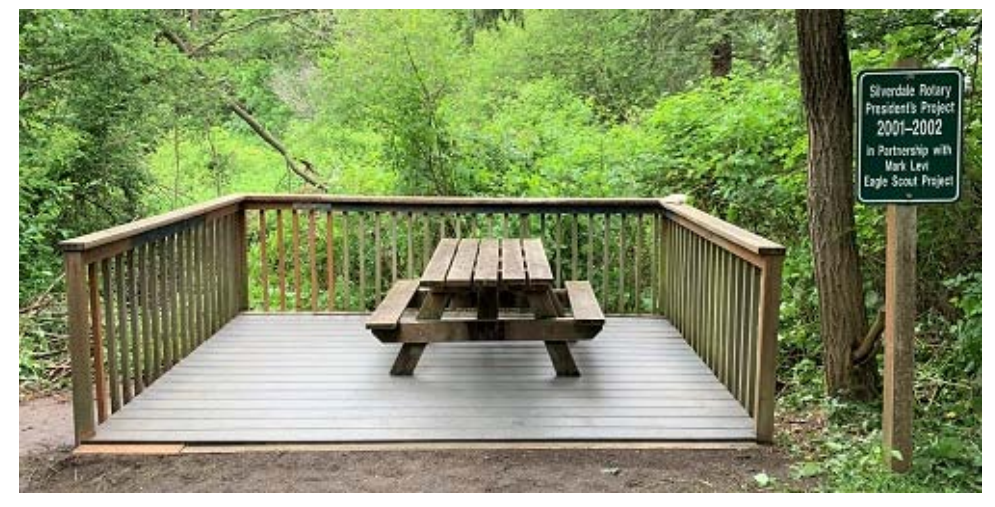
The "After" photo

The "Before" photo of the platform on the Clear Creek Trail