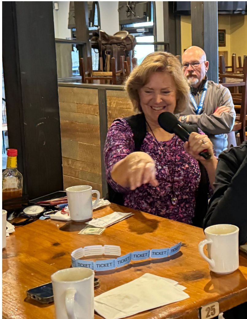
From the Sept. 11 meeting...