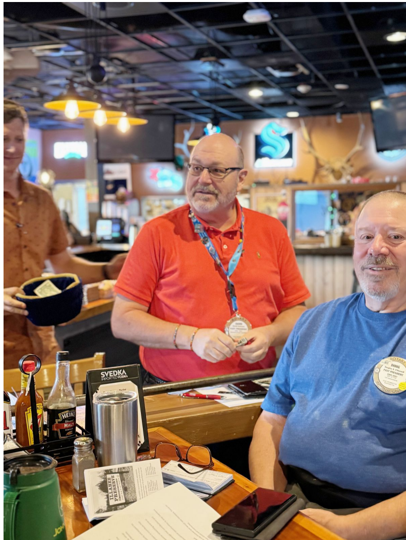
From the Aug. 14 meeting...