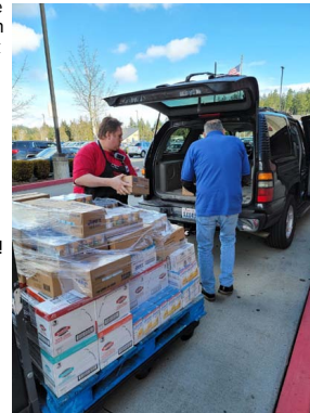
Way to go, Rotary Super-Shoppers!