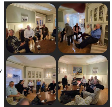
Faculty at Johnson City

Over the past 11 months, RLI-NEA has held three Faculty Training Seminars, resulting in 20 new Faculty Members, two updated Faculty Members ,and three new Faculty Trainers! Those training seminars were held in conjunction with the Wakefield RLI-NEA event in Wakefield, MA on April 30, 2022, the RLI-NEA Annual meeting in Parkridge, NJ on August 19, 2022, and the Rotary Empire MD PETS Event in Syracuse, NY on March 17, 2023. Many of those new faculty members have already observed other faculty members and have been observed themselves. They are very ready, willing, and able to facilitate future RLI-NEA events! All of them bring their enthusiasm for Rotary and their engaging approaches to facilitating professional adults as learners to the RLI-NEA experience.