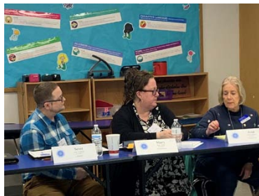
Creating a service project...