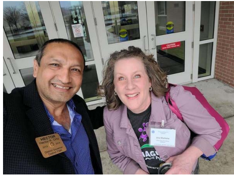
RLI Part III Graduates