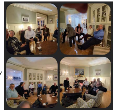
Faculty at Johnson City

Over the past 11 months, RLI-NEA has held three Faculty Training Seminars, resulting in 20 new Faculty Members, two updated Faculty Members ,and three new Faculty Trainers! Those training seminars were held in conjunction with the Wakefield RLI-NEA event in Wakefield, MA on April 30, 2022, the RLI-NEA Annual meeting in Parkridge, NJ on August 19, 2022, and the Rotary Empire MD PETS Event in Syracuse, NY on March 17, 2023. Many of those new faculty members have already observed other faculty members and have been observed themselves. They are very ready, willing, and able to facilitate future RLI-NEA events! All of them bring their enthusiasm for Rotary and their engaging approaches to facilitating professional adults as learners to the RLI-NEA experience.