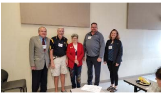
Participants in the Graduate Course Lackawanna Part I Participants