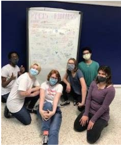
Rotaract of Virginia Commonwealth University:

Thank you to those who came to our Project WARM event! We were able to deliver wood to 10 families. Good job everyone! Stay tuned for our next events.