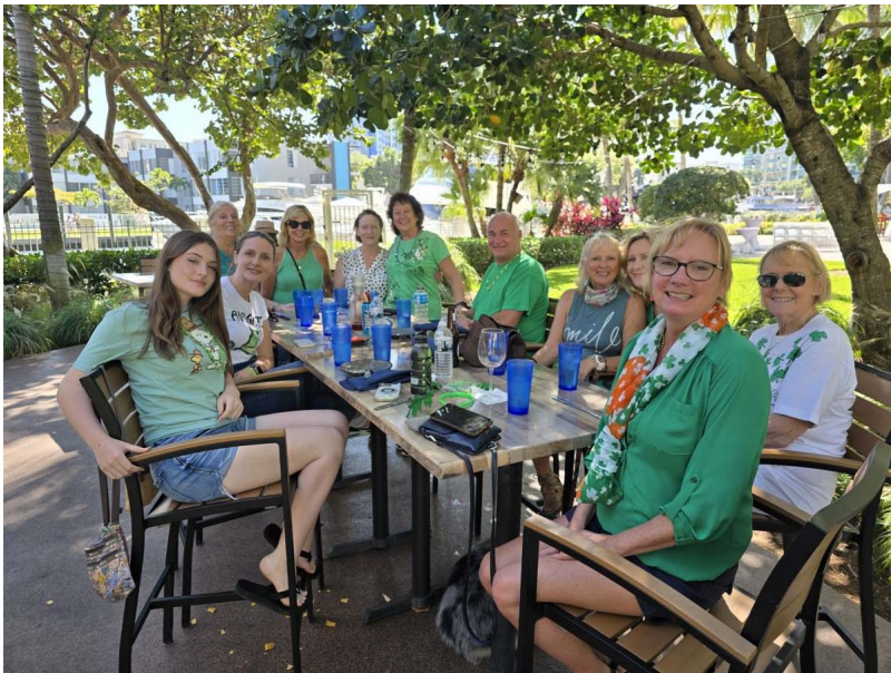
New friends, one from Dublin!