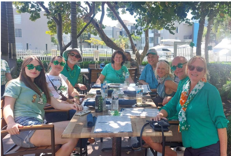
After party at the Boathouse at the Riverside