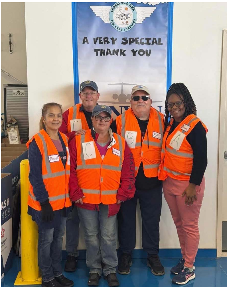
Pompano Beach Rotary Club Volunteers

For videos and more pictures from Challenge Air Fly Day, visit our Facebook and Instagram pages.