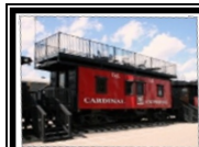
Caboose #2