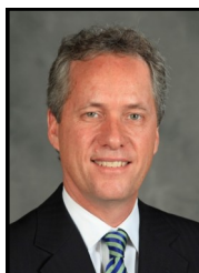
Greg Fischer Mayor City of Louisville

Galt House West, 3rd Floor, Archibald Room