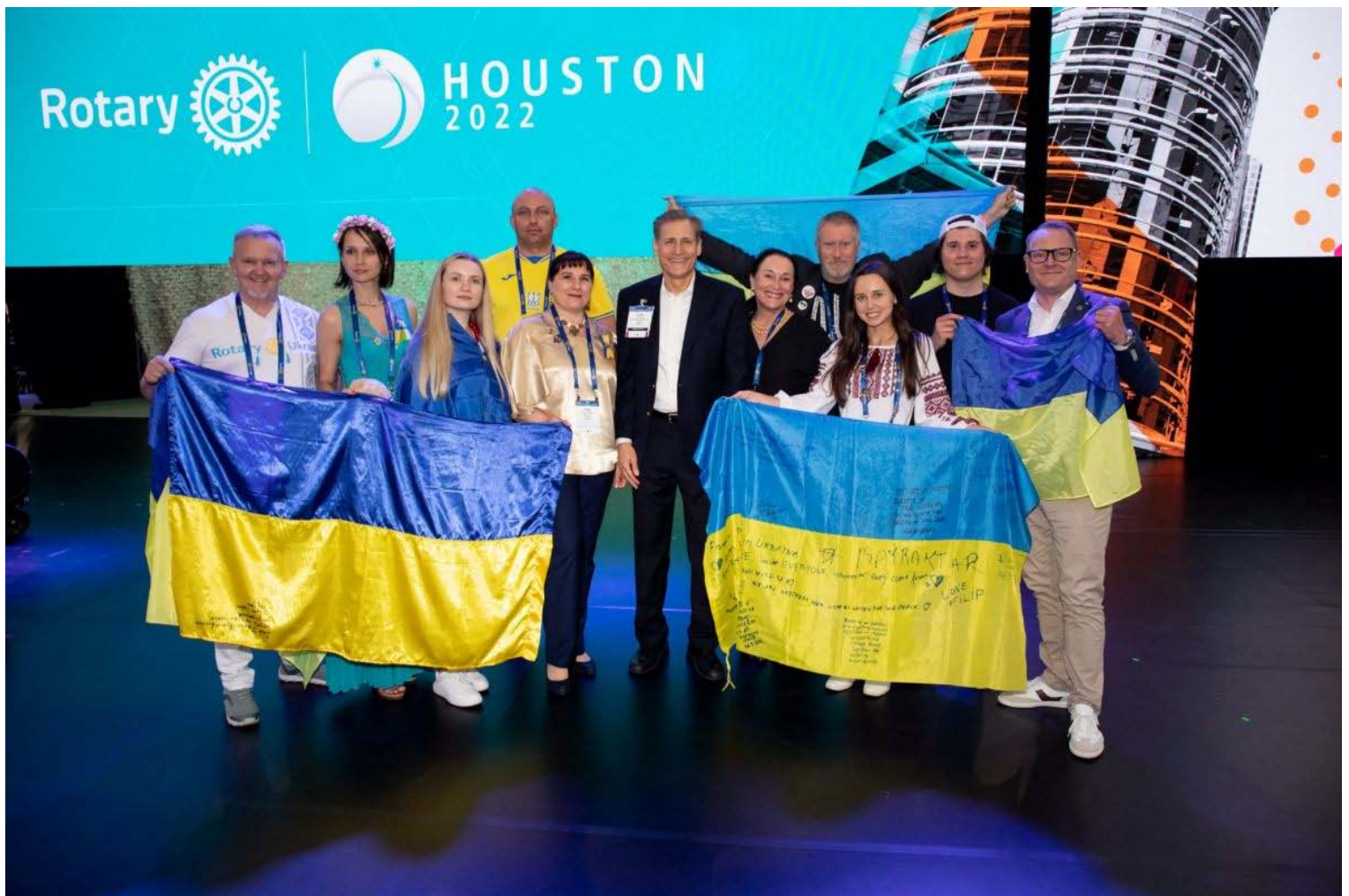
The Ukrainian delegation went to great effort to join us