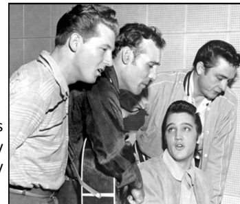
Photo: At Sun Records in Memphis on December 4, 1956, with Jerry Lee Lewis, Carl Perkins, Johnny Cash and Elvis Presley.