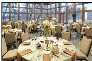
Gheens Foundation Lodge