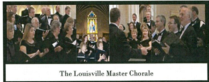
The Louisville Master Chorale